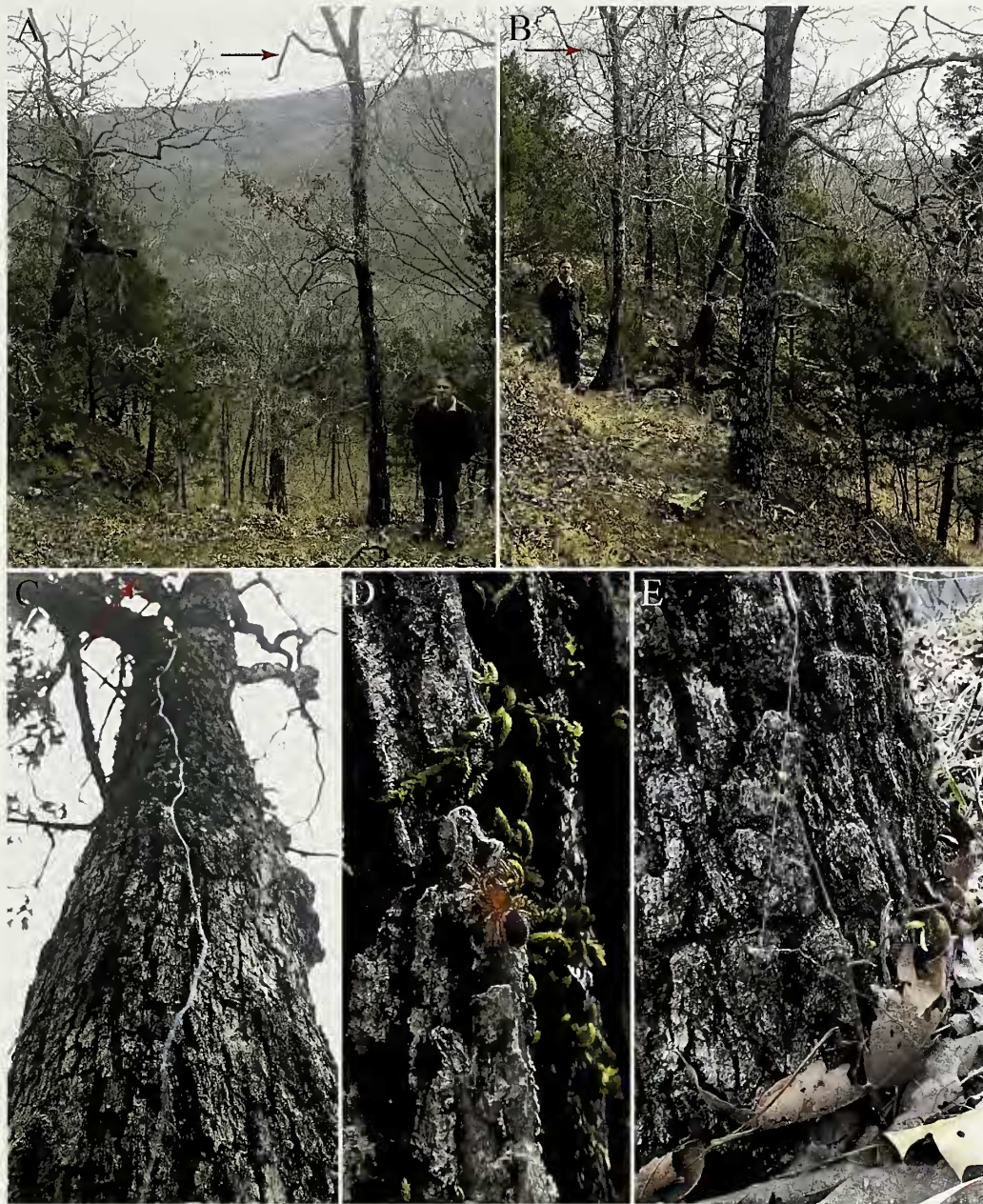
Figure 1.—Ballooning site. A. south-facing view of ballooning tree overlooking the valley; B. east-facing view of ballooning tree depicting steep slope; C. pre-ballooning silk band on trunk, leading to horizontal limb; D. spiderling climbing pre-ballooning band; E. base of tree showing pre-ballooning band diffusing quickly into litter. Red arrows indicate ballooning limb.

horizontally on the ground. Our observations are similar to Baerg's in the following ways: emergence date (15–22 March); silk band width (2 mm) and height (4–9 m); silk band ending on a horizontal limb; and tree size (not less than 15 cm DBH). The present observation occurred in the afternoon and Baerg (1928) described primarily morning activity ending mid-day. However, given the sparse activity and well-developed silk band, we suspect these individuals represented the last members of a ballooning event.